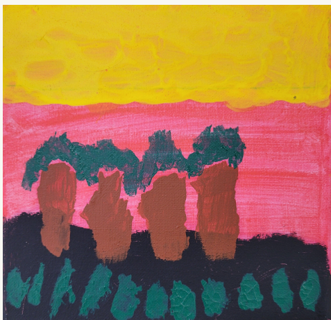
Name: Lochlan B. Age: 16

Artistic Statement: My artwork shows the sun, trees and the ground, it represents a rainforest. Grass comes up from the ground and connects to the trees, the sun gives the land energy by warming it up and changing the colours. Carers week means a lot to me as it makes me happy.