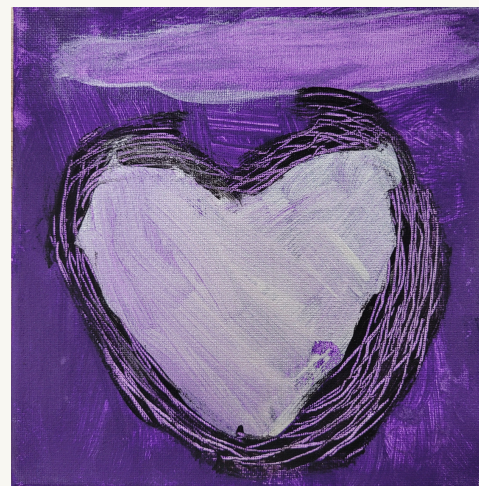
Name: Trinh Age: 17

Artistic Statement: My artwork shows the sun, trees and the ground, it represents a rainforest. Grass comes up from the ground and connects to the trees, the sun gives the land energy by warming it up and changing the colours. Carers week means a lot to me as it makes me happy.