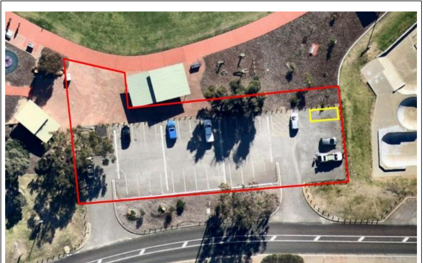
Location 1. Fleming Reserve, High Wycombe