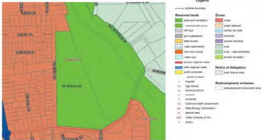
Existing Zoning: Parks and Recreation