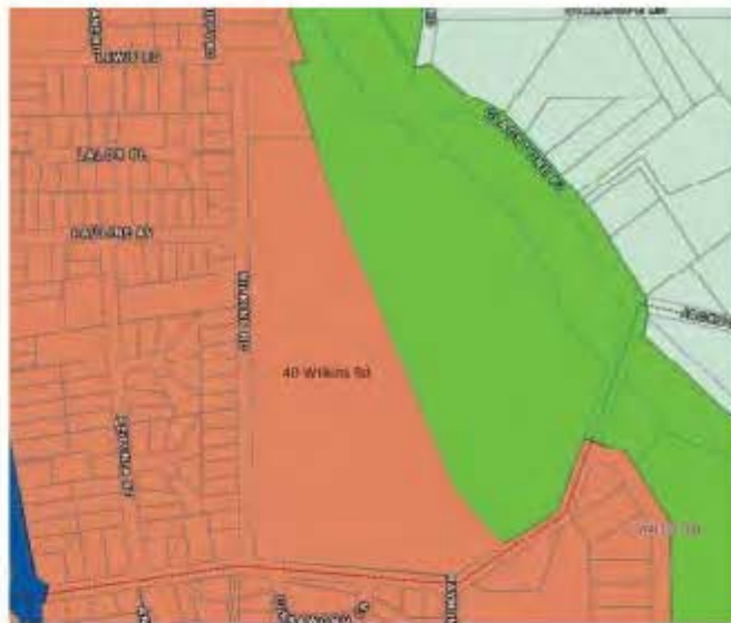
New Zoning: Urban