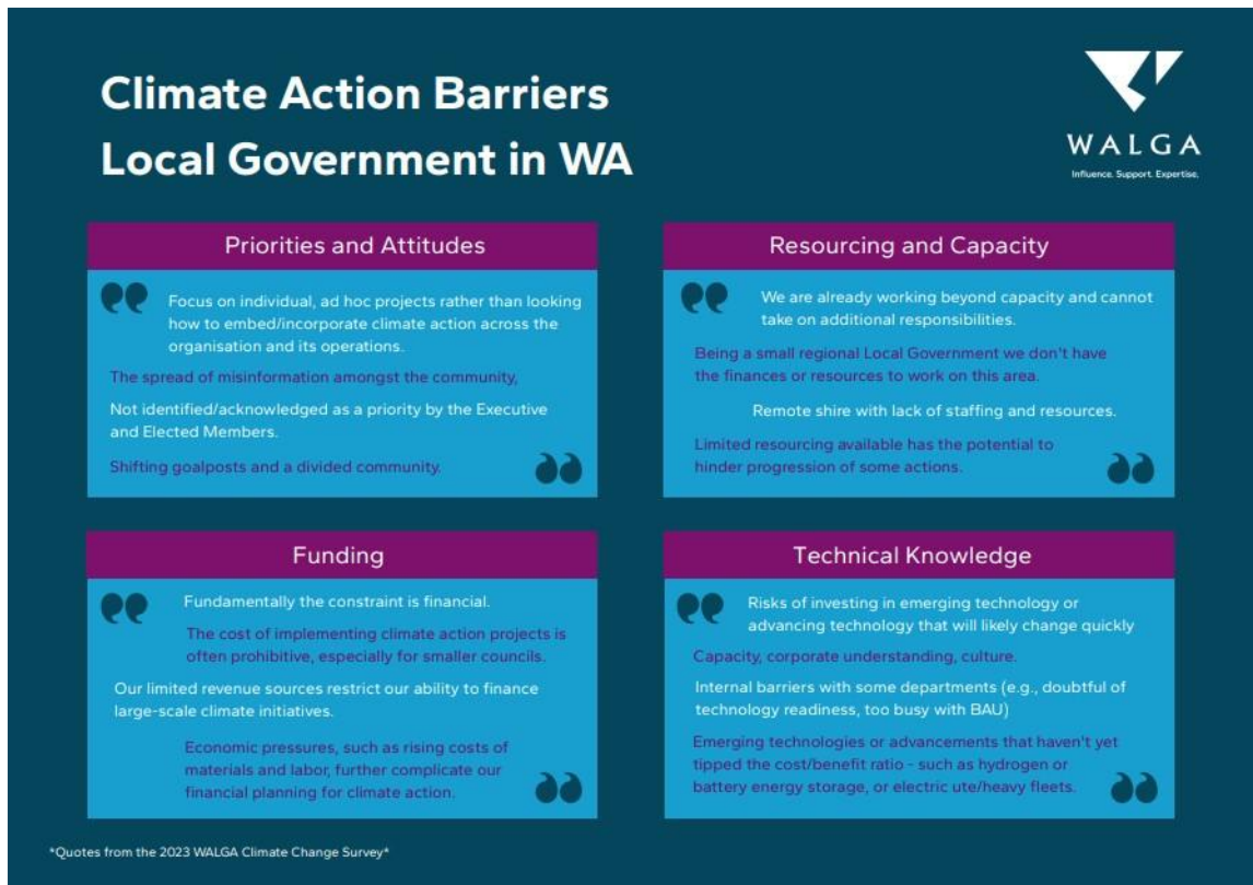
Figure 2: Snapshot of 2024 WALGA Local Government Climate Change Data in relation to main barriers faced by Local Government in addressing climate change.