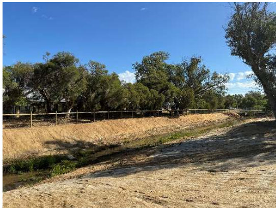
Rear reserve (buffer)