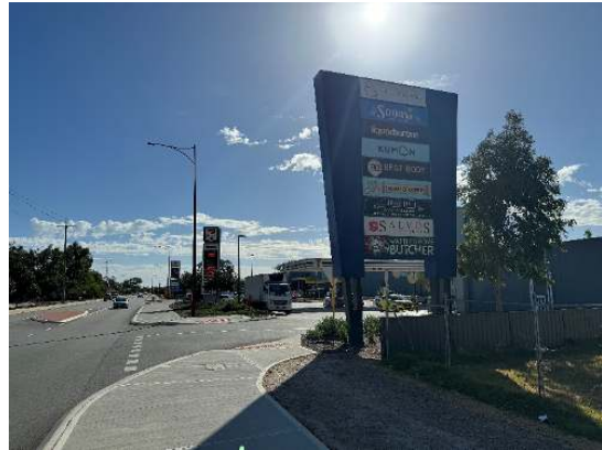
View of adjoining commercial property