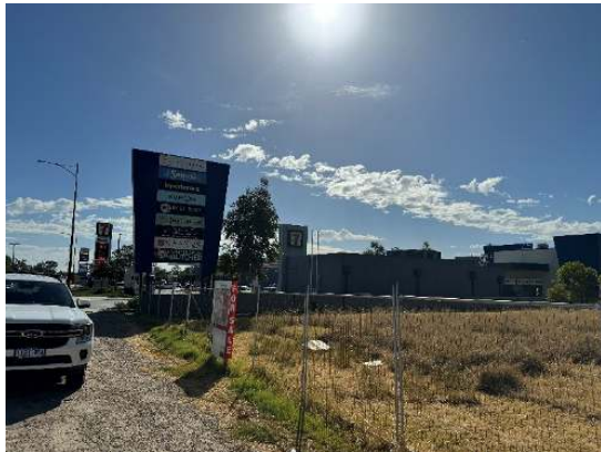
View of adjoining commercial property