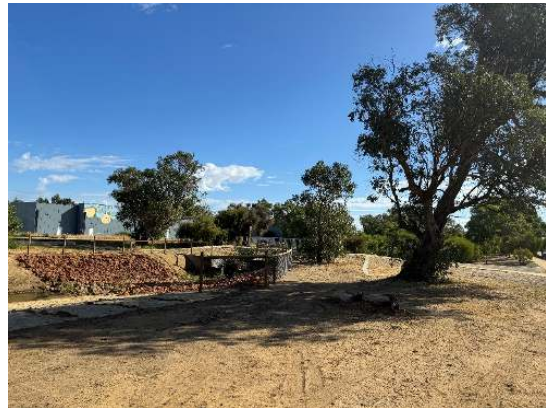
Rear reserve (buffer)