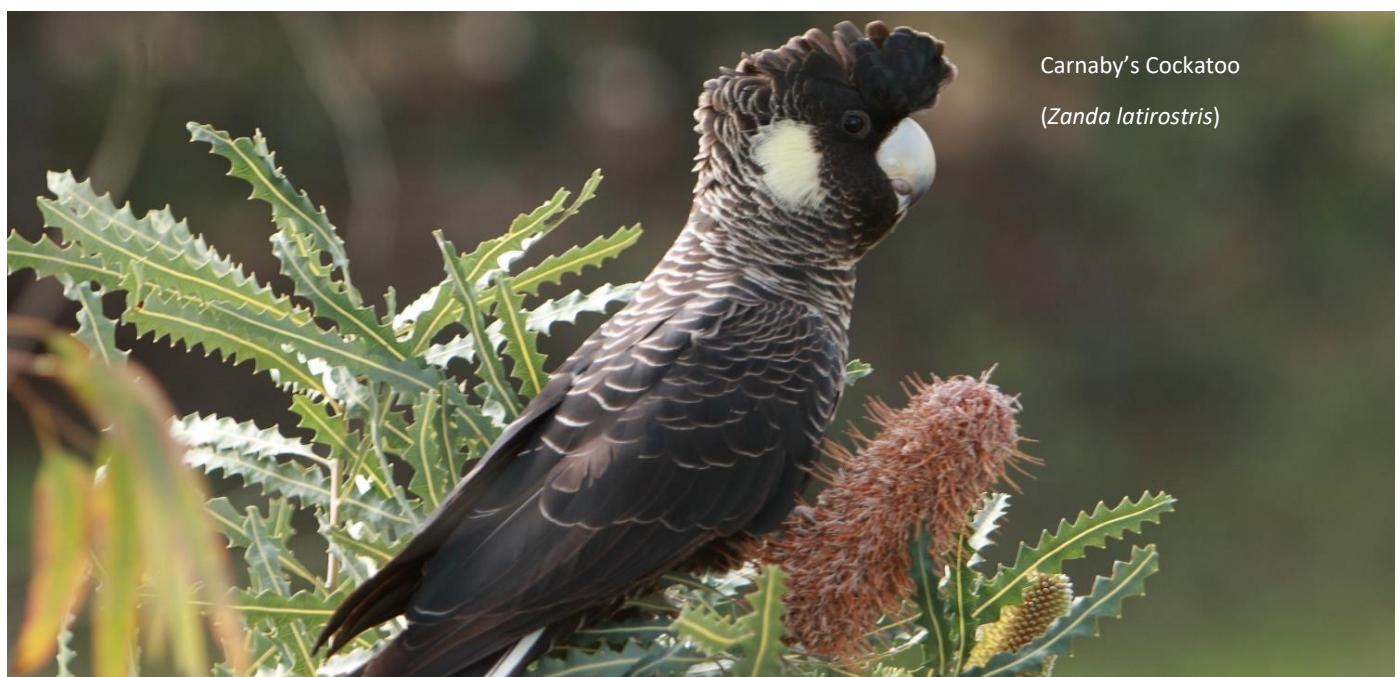
Carnaby's Cockatoo ( Zanda latirostris )

To achieve the aspirational City-wide target of increasing the conservation protection status of 500ha land, containing approximately 270ha of native vegetation, as well as the goals and strategic objectives of the LBS, the City will undertake a program of strategies and actions, as outlined in the table below.