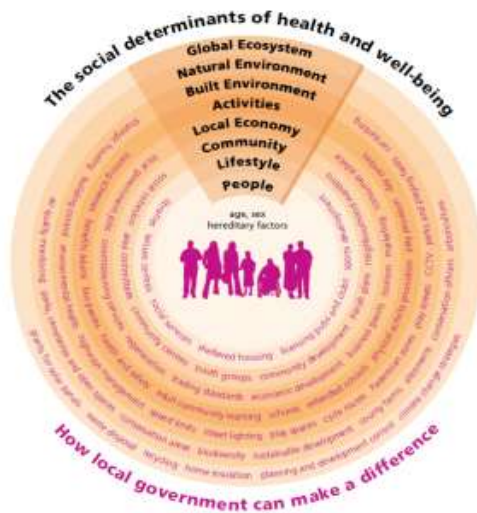
Figure 1: How local government can make a difference in health and wellbeing

Promoting community wellbeing is about intervening "to change those aspects of the environment which are promoting ill health, rather than continuing to encourage individuals to change their behaviours and lifestyles when, in fact, the environment in which they live and work gives them little or no choice or support for making such changes". 2