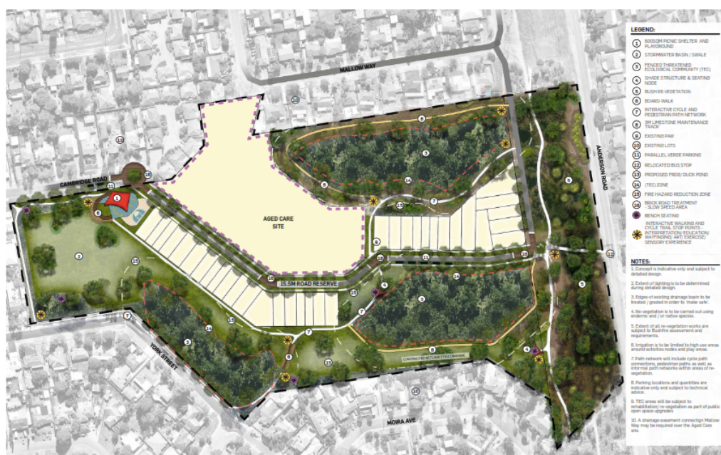
Figure 5: Cambridge Reserve Project Concept Plan

https://www.kalamunda.wa.gov.au/building-development/planning/projects/cambridge-reserve