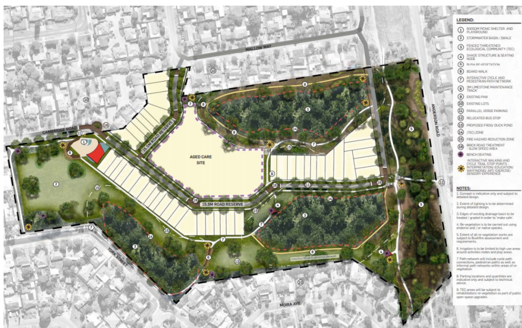
Figure 6: Concept Plan with Option for 1 ha Aged Care site

The City has an extensive history of strategically identifying sites which may be suitable for aged care accommodation. Cambridge Reserve is located close to shops, community services and amenities, and has good access to services including sewer which is preferred for an integrated aged care development.