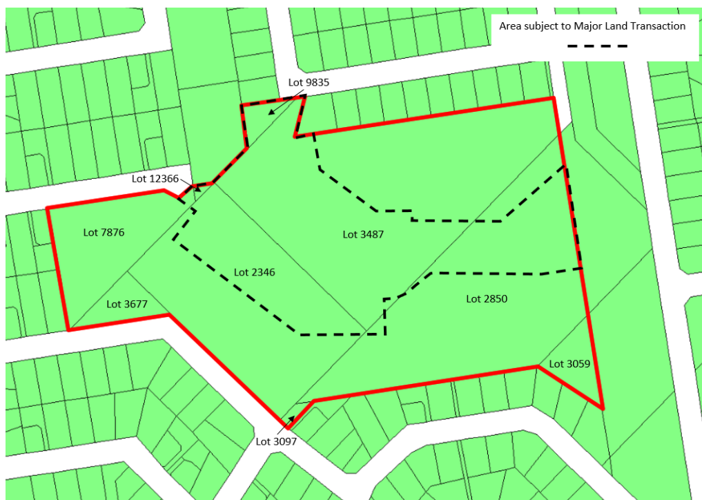
Figure 4: Lot Plan and Major Land Transaction Area