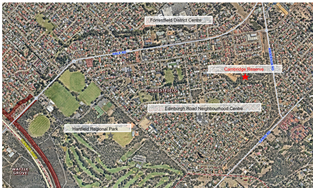
Figure 1: Locality Plan

Cambridge Reserve is currently unimproved containing degraded bushland with portions of uncleared native vegetation. The site has been the subject of anti-social behaviour and degradation over past decades. The housing surrounding Cambridge Reserve provides little surveillance and there are safety concerns stemming from the lack of lighting, formal paths and surveillance. The site contains areas of good quality vegetation but also areas of degraded vegetation, introduced species, and signs of erosion. Despite this, the site is valued by surrounding residents for its informal walking paths, native bushland, and wildlife.