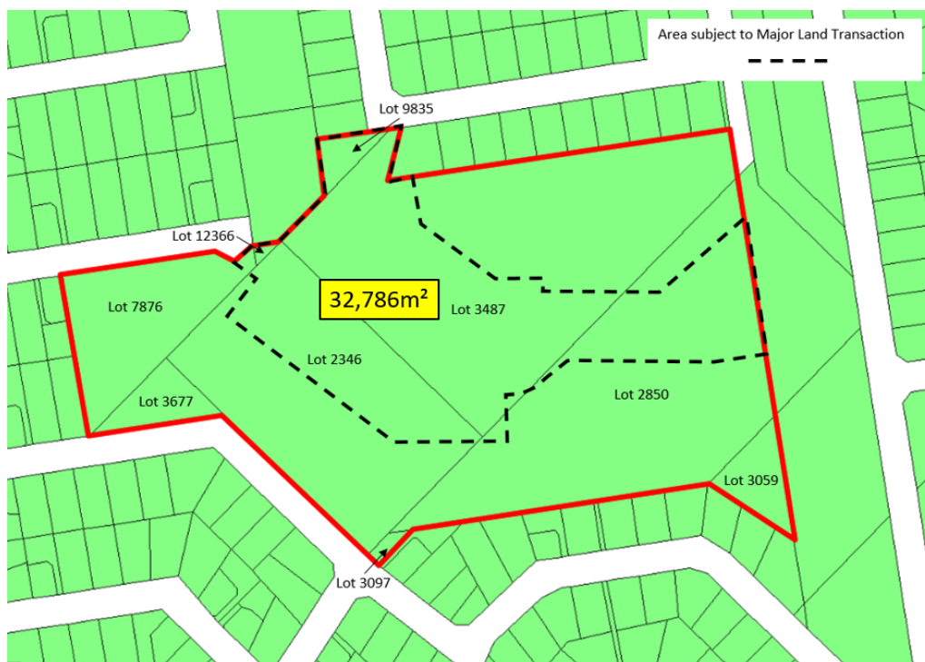
Figure 7: Land area subject to acquisition

Valuations at full commercial land value have been prepared for this acquisition in consultation with Landgate on behalf of DPLH and the City's independent land valuer and identified a total unimproved land value of $2.9m. Given the broader community benefits associated with the proposed Cambridge Reserve Project, DPLH has offered, subject to Ministerial approval, to sell the 32,786m 2 (approx. 3.28ha) developable portion of the site for a discounted price of $536,500.