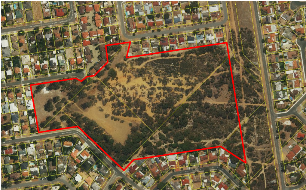
Figure 2: Aerial Image