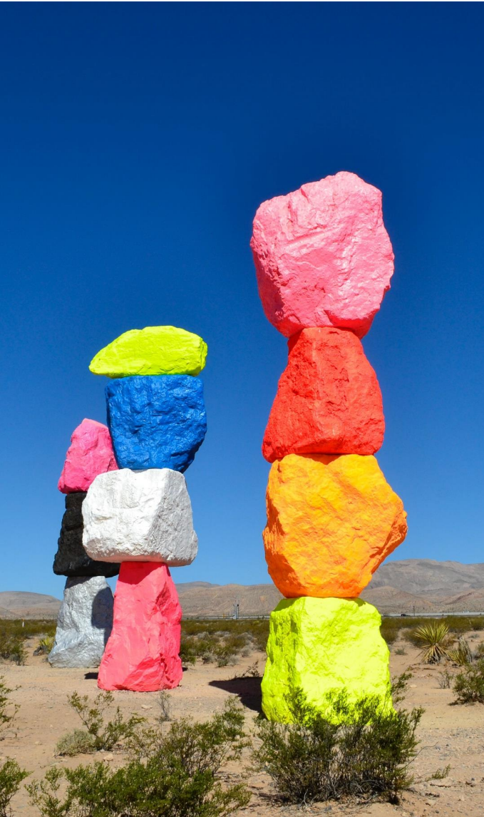
City of Kalamunda