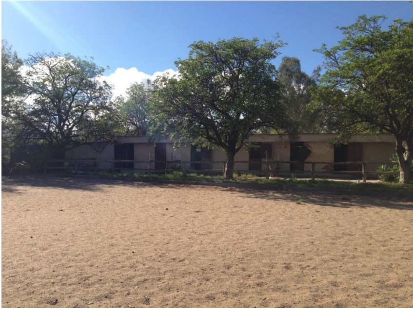
Plate 4 – Former Stables to be used for Product Display