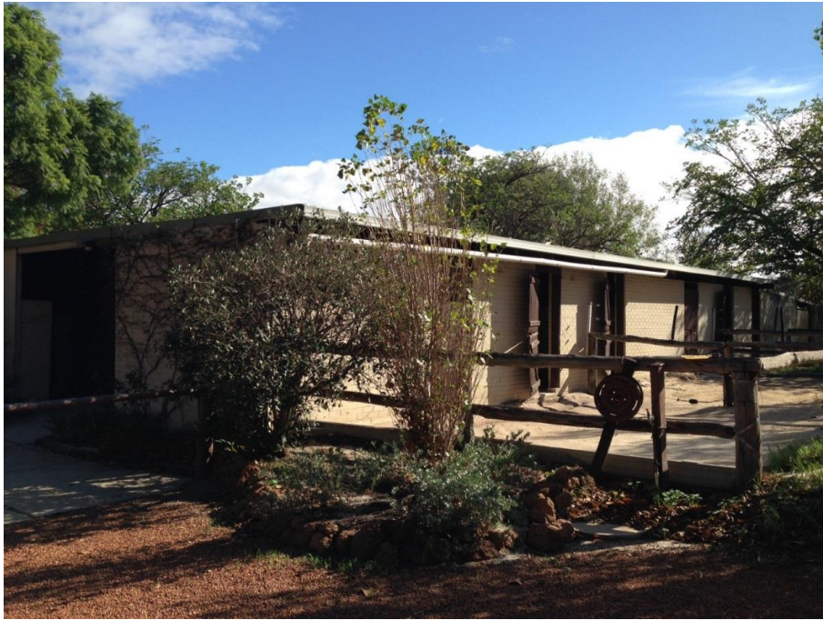
Plate 2 - Former stables to be used for Product Display