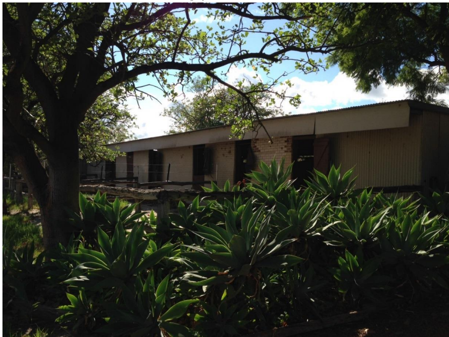
Plate 3 - Former Stables to be used for Product Display