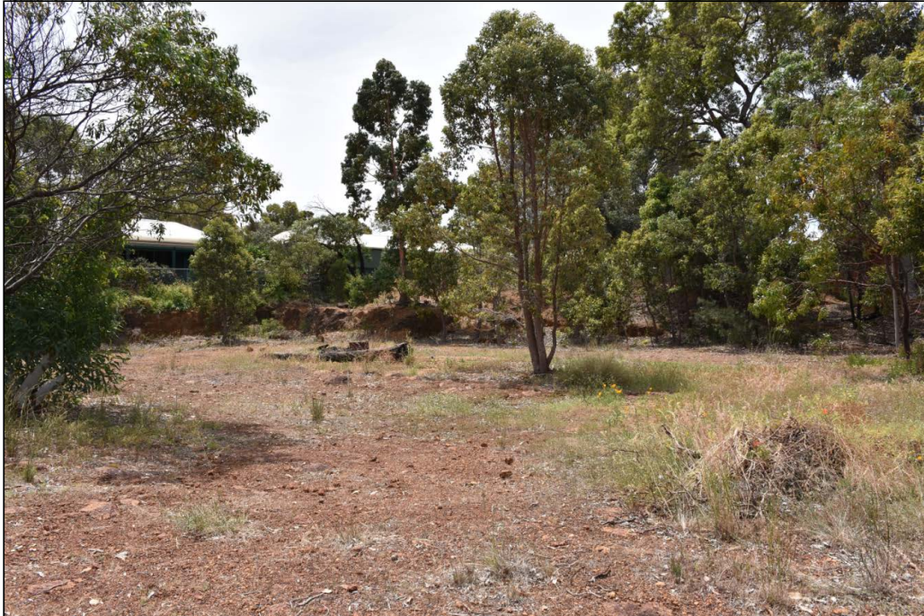
Cleared central area

The central portion of the lot has been cleared and there are some physical indications that gravel may have historically been sourced from the property.