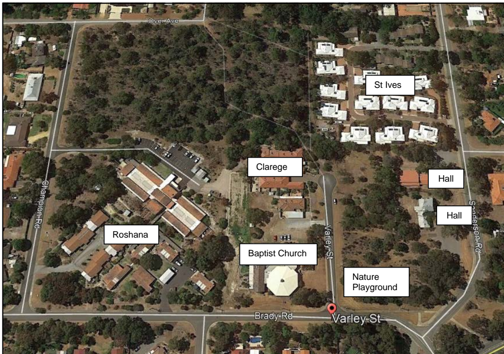
Figure 4 – Aerial showing surrounding land uses/ car parking reciprocity and walkable areas

A map showing the land uses in Varley Street and the immediate surrounds is included as Figure 4 .