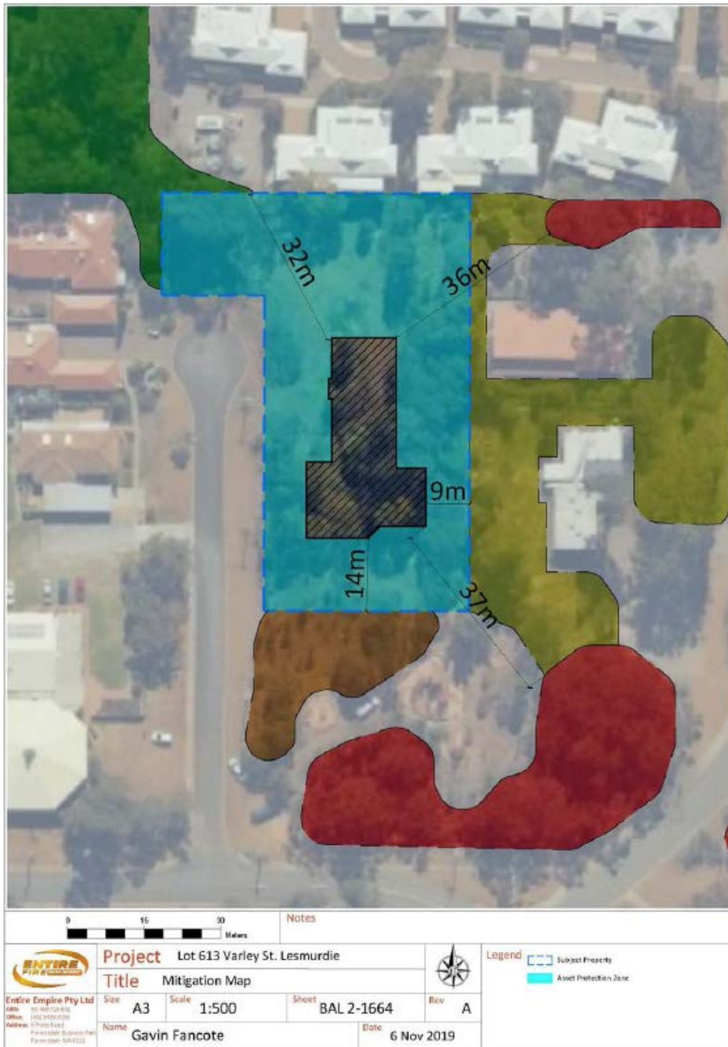
Figure 5 – Asset Protection Zone (Extract Figure 3 from the Bushfire Management Plan)