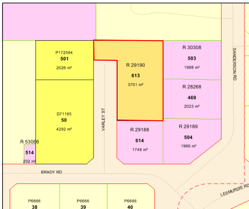
Figure 1: Location Plan

Lot 613 has an approximate area of 3701m 2 and has direct frontage to Varley Street.