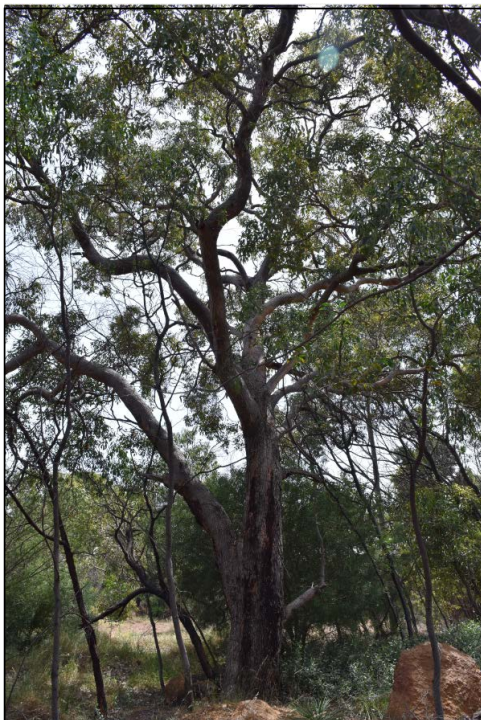
Tree to be retained in rear play area

The majority of species on site are introduced. The Friends of Pax Reserve have been consulted and have marked/ taped introduced and dead trees on site that they recommend for removal.