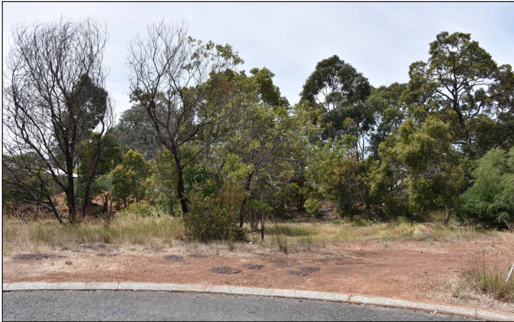
View from Varley Street

The majority of species on site are introduced. The Friends of Pax Reserve have been consulted and have marked/ taped introduced and dead trees on site that they recommend for removal.