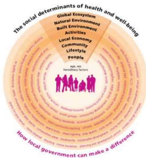
Figure 1: How local government can make a difference in health and wellbeing

Promoting community wellbeing is about intervening "to change those aspects of the environment which are promoting ill health, rather than continuing to encourage individuals to change their behaviours and lifestyles when, in fact, the environment in which they live and work gives them little or no choice or support for making such changes". 2