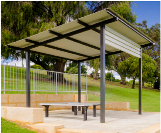
Shade shelter with seaing and drinking fountain