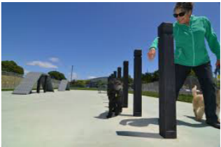
Typical agility posts