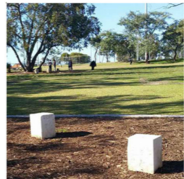
Block seating at sand play