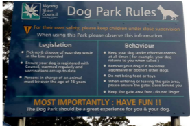
Typical entry signs