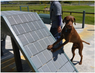
Typical agility ramp