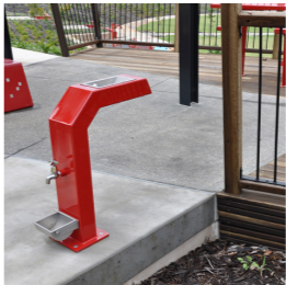
Drinking fountain with tippable dog bowl