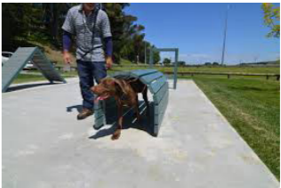
Typical agility tunnel