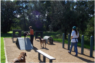
Typical agility layout