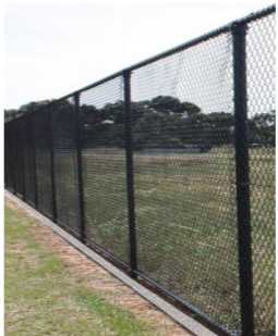
Fence with flush 150mm concrete strip beneath