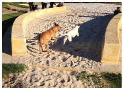
Dog sand play / dig area