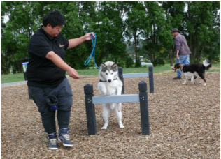
Typical agility jump