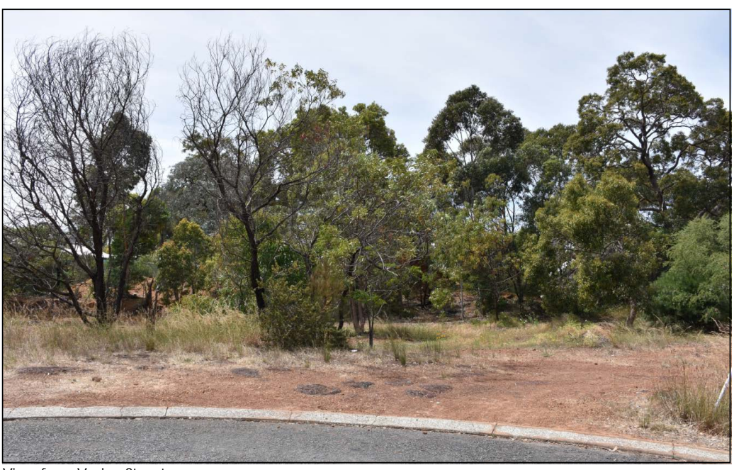
View from Varley Street

The majority of species on site are introduced. The Friends of Pax Reserve have been consulted and have marked/ taped introduced and dead trees on site that they recommend for removal.