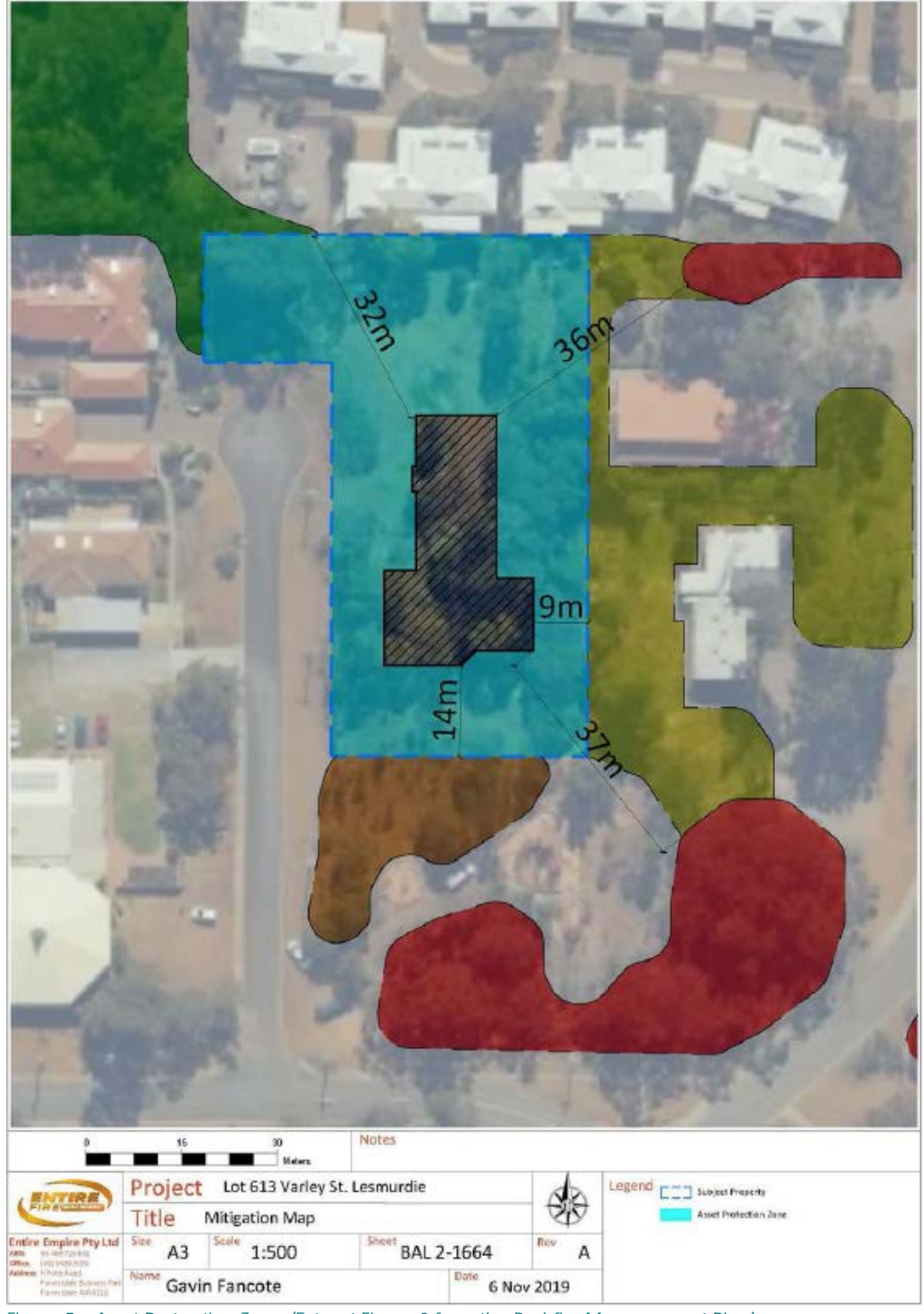
Figure 5 – Asset Protection Zone (Extract Figure 3 from the Bushfire Management Plan)