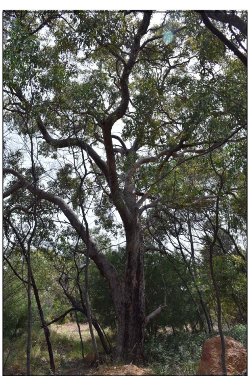
Tree to be retained in rear play area

The majority of species on site are introduced. The Friends of Pax Reserve have been consulted and have marked/ taped introduced and dead trees on site that they recommend for removal.