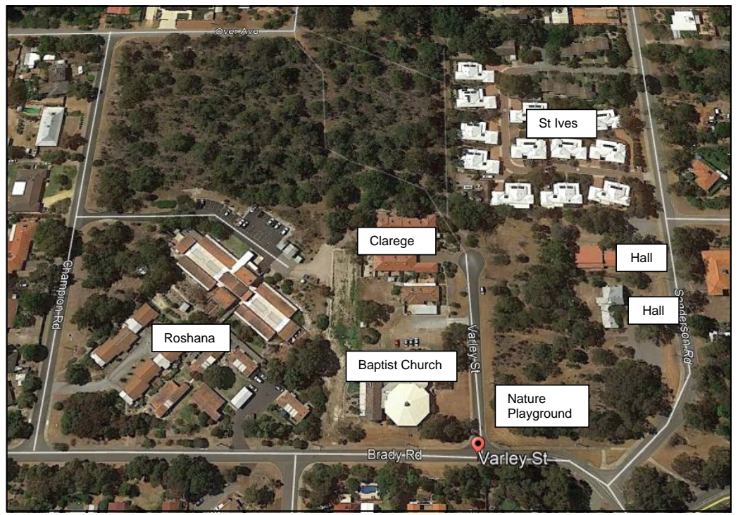
Figure 4 - Aerial showing surrounding land uses/ car parking reciprocity and walkable areas

A map showing the land uses in Varley Street and the immediate surrounds is included as Figure 4.