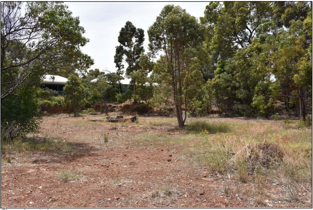
Cleared central area

The central portion of the lot has been cleared and there are some physical indications that gravel may have historically been sourced from the property.