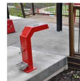
Drinking fountain with tippable dog bowl