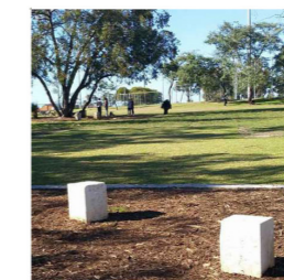
Block seating at sand play