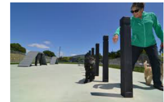
Typical agility posts