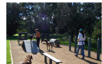
Typical agility layout