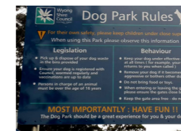
Typical entry signs