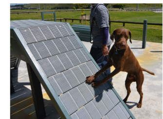
Typical agility ramp