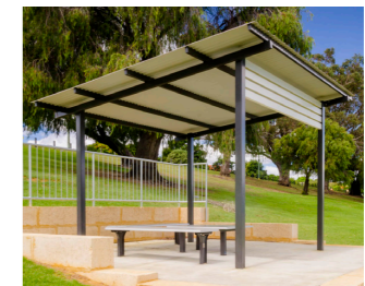
Shade shelter with seating and drinking fountain