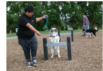
Typical agility jump