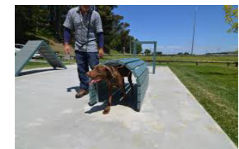
Typical agility tunnel