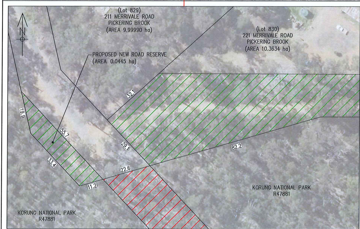
INSET SCALE 1:500