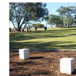
Block seating at sand play