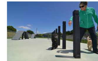
Typical agility posts