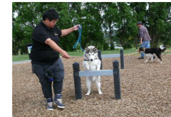
Typical agility jump