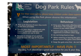
Typical entry signs