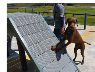
Typical agility ramp