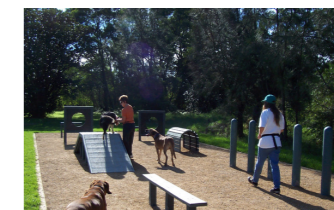
Typical agility layout