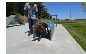
Typical agility tunnel