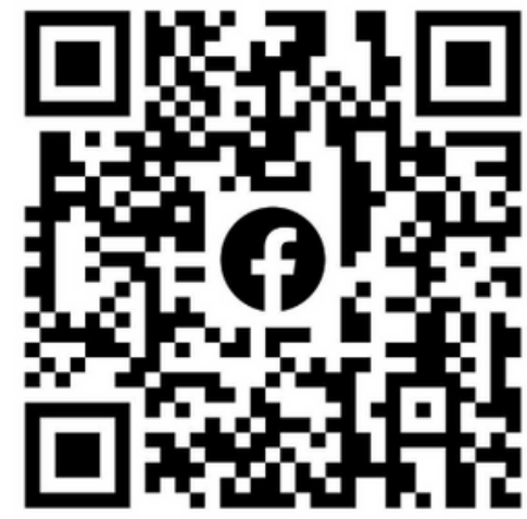
Feed it Forward Inc