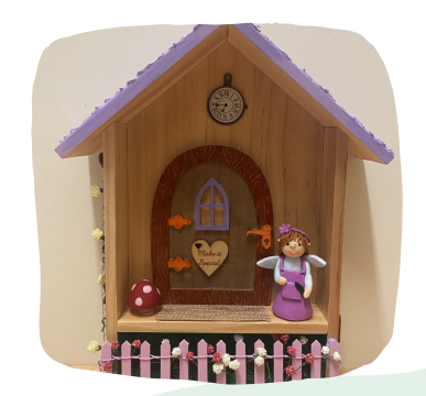
Woodlupine Family Centre