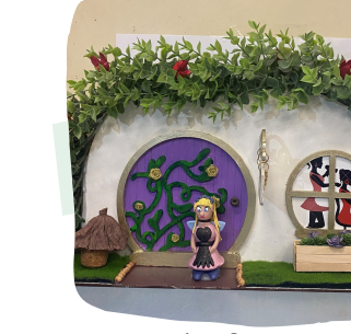
Halo for Hair

Sometimes the fairy doors get damaged. If you see one broken, let us know at youth@kalamunda.wa.gov.au