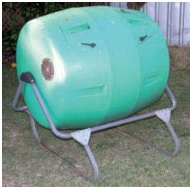
Figure 3: Compost tumbler

Compost tumblers (revolving drums) are commercially available and are easier to handle. Make sure that the compost is regularly wetted to keep the moisture level sufficient. A guide to adequate moisture is when you can just squeeze a little free moisture from a handful of material.