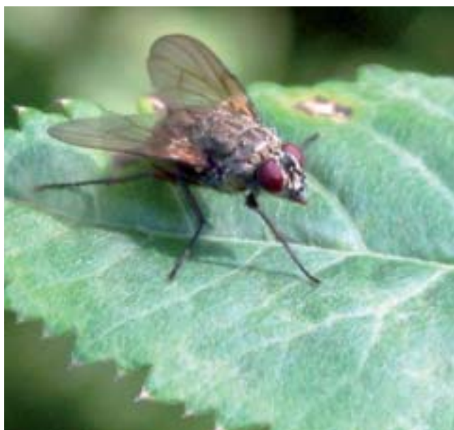
Figure 1(a): Stable fly.

One hazardous downside of using raw manure is fly breeding, which can also occur in uncovered compost heaps. Allowing flies to breed can cause a nuisance to neighbours and constitute an offence under the "Fly Eradication Regulation" (Department of Health Act 1996).