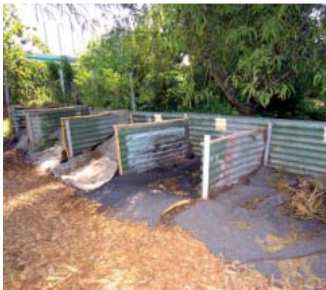
Figure 2: Covered compost heaps at City Farms, East Perth

At least two compost heaps should be alternated to allow for sufficient maturing time after establishment. Regular turning and covering of the compost heaps will reduce or prevent fly breeding, since flies breed in decomposing organic material near the soil surface.