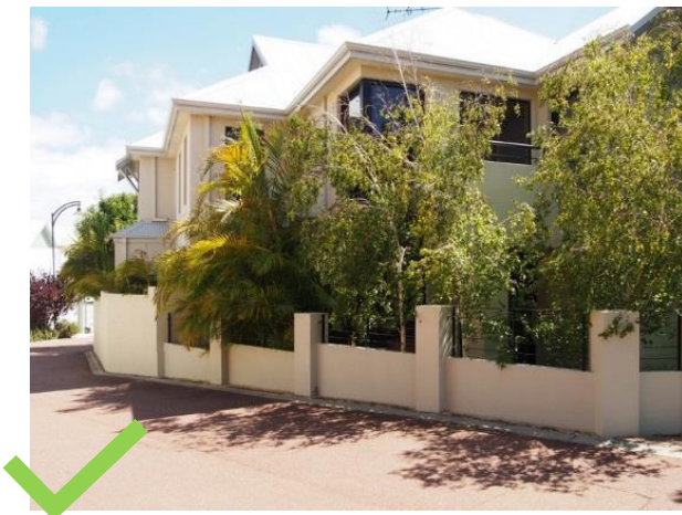
1.2m in Front Setback and 1.8m behind Front Setback. Fence follows Natural Ground Level