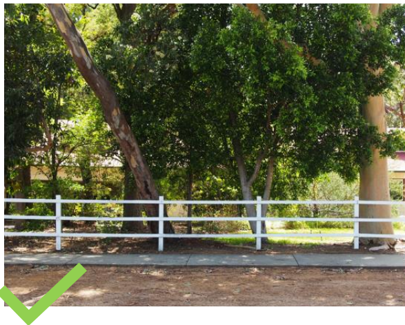
Rural style fencing to be open style and blend with the surrounding landscape