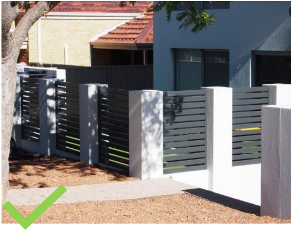
Visual permeability extends within the Front Setback including sides