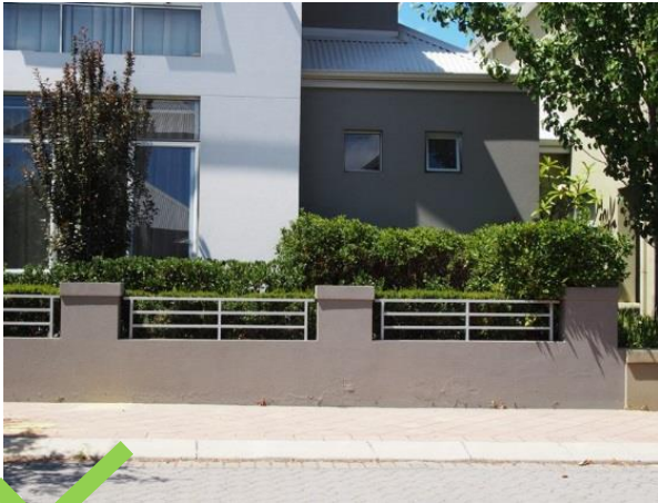
<1.2m visually permeable with masonry elements