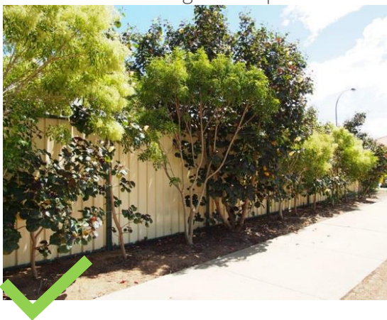
Where a 1.8m side fence abuts a public street or ROW, high quality landscaping features shall be planted.