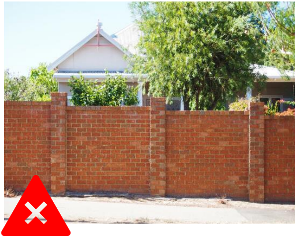
>1.2m street surveillance is not maintained