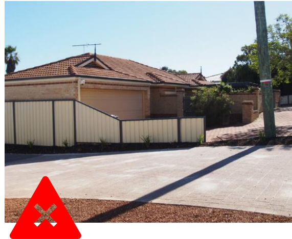
No powder coated steel or aluminium sheeting permitted in Front Setback