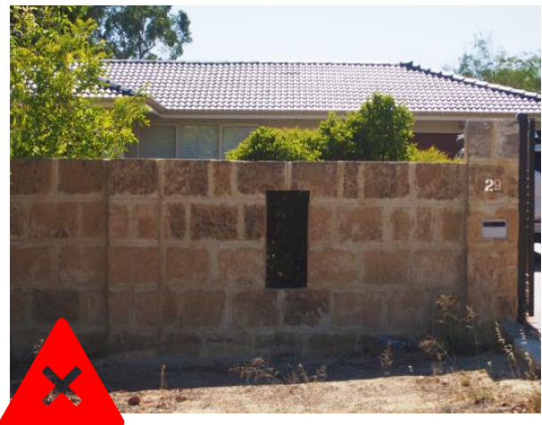
Not visually permeable, street surveillance is not maintained