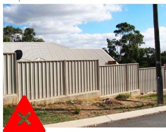
Large expanses of blank wall should be broken up with colour, texture, or screened with landscaping.