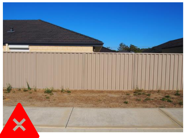
Powder coated steel or aluminium not permitted in the Front Setback area.