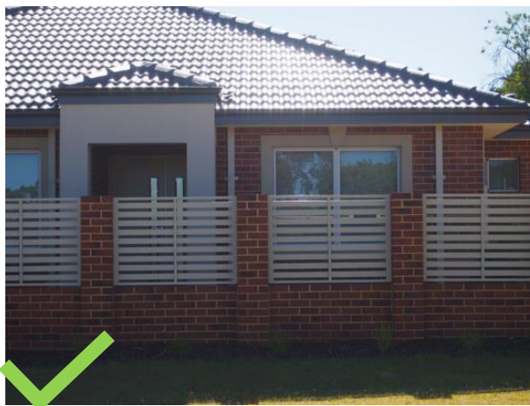
Visually permeable on retaining to a maximum height of 1.8m