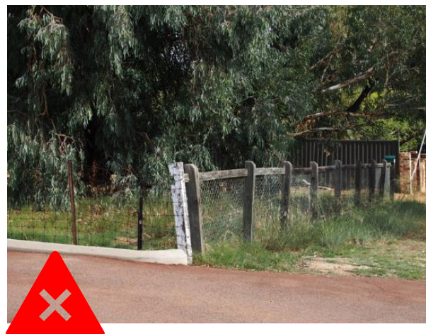
Chain link fencing, star pickets and barbed wire not permitted in front Setback